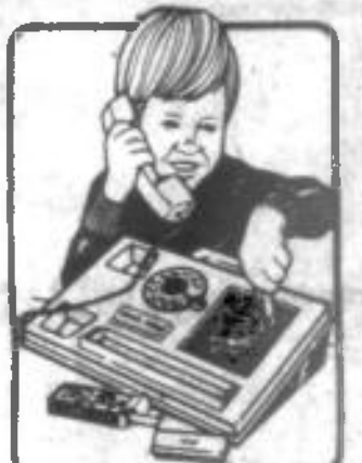
153 Message Center $9 26 A fascinating toy for preschoolers with the look and feel of a real telephone. Action dial "dings".