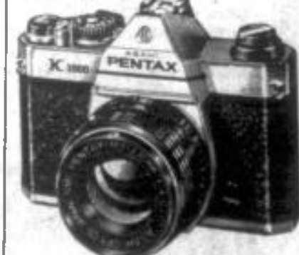
PENTAX K1000 Brings you the pleasure and quality of fine 35mm photography at a budget price that fits today's inflationary times. F2.0 lens, 50mm $149 95