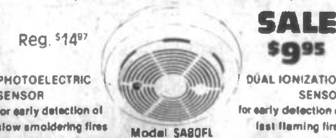
Reg. $14 97 SALE $9 95 PHOTOELECTRIC SENSOR for early detection of slow smoldering fires. Model SABOFL. DUAL IONIZATION SENSOR for early detection of fast flaming fires.