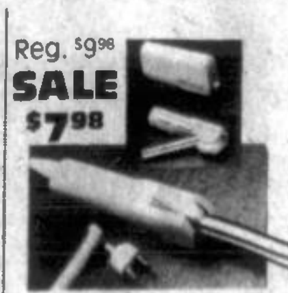
Reg. $9 98 SALE $7 98 CURL 'n CARRY Mini Curling Iron Model C115 Curl 'n Carry. Folds away in its own carrying case, then unpacks to give you professional curls in minutes. 110 or 220 volts. Ready hot signals when temperature is right. Curl 'n Carry's tip stays cool even when the barrel is hot. Easy-to-use 6-foot removable coiled cord. One-Year Warranty. U.L. listed.