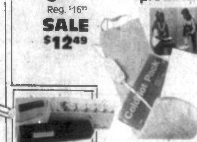
Reg. $16 95 SALE $12 49 EXPRESS CURL Straight to curly in minutes Model QS1 Express Curl. The compact hairsetter that gives you curls in minutes. European adapter plug included for worldwide use. 6 tangle-free rollers heat up in 3 minutes. Clip and cord storage compartments. 110/220V. U.L. approved. One-Year Warranty. SALE $9 95