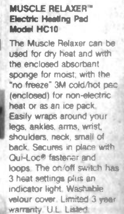
MUSCLE RELAXER Electric Heating Pad Model HC10 The Muscle Relaxer can be used for dry heat and with the enclosed absorbant sponge for moist; with the "no freeze" 3M cold/hot pack (enclosed) for non-electric heat or as an ice pack. Easily wraps around your legs, ankles, arms, wrist, shoulders, neck, small of back. Secures in place with Qui-Loc® fastener and loops. The on/off switch has 3 heat settings plus an indicator light. Washable velour cover. Limited 3 year warranty. U.L. Listed.