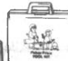
724 Tool Kit $13 66 23-piece hard-working tool kit, full of gadgets for young "do-it-yourselfers". Features a spring action, wind-up drill.