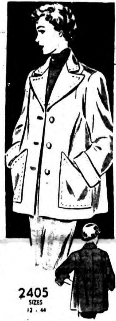
TRIM TOPPER. This is the little top coat—the kind that goes with skirt and blouse teams, over dresses too. Neatly tailored with notched collar, it could be made in plaid or plain wool, corduroy, camel's hair, new poodle cloth.

No. 2405 is cut in sizes 12, 14, 16, 18, 20, 36, 38, 40, 42 and 44. Size 18, 24 yds. 54 in. Send 25 cents for pattern with name, address, style number and size. Address Pattern Bureau, The Times Record, Box 42, Old Chelsea Station, New York 11, N. Y.