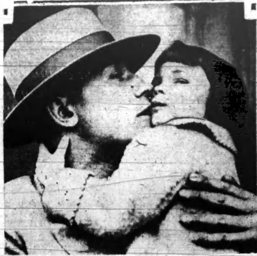
JACK SHARKEY AND DAUGHTER